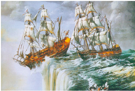
Is the world 'flat' ...

Department of Sociology and Social Work University of Wisconsin-Stevens Point